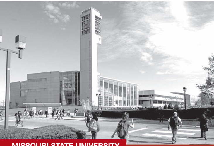
MISSOURI STATE UNIVERSITY